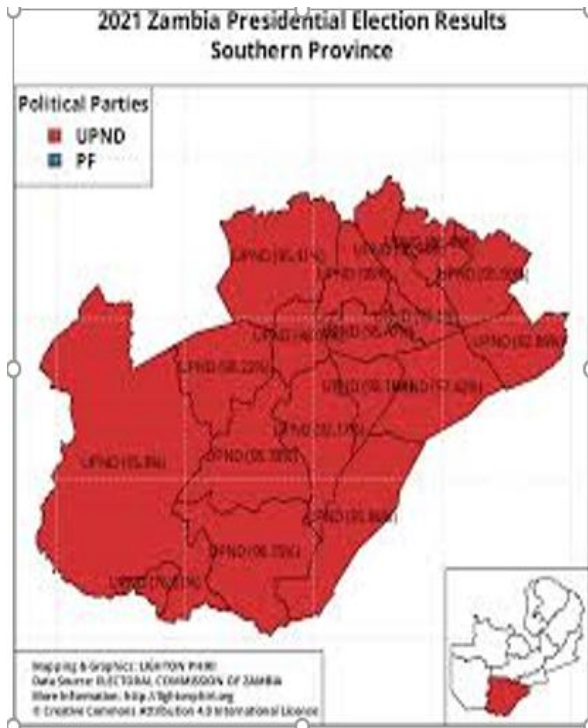
Figure 3 : 2021 Zambia presidential election results southern province