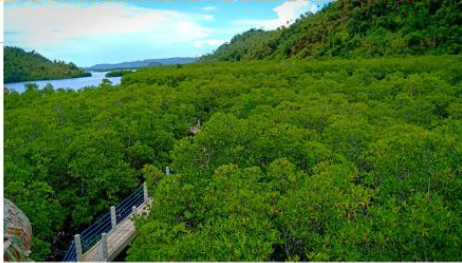
Figure 2 b :Rationale (How the project relates to biodiversity conservation)