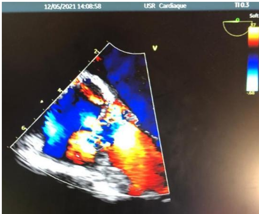
Figure 2 : TEE showing severe aortic regurgitation