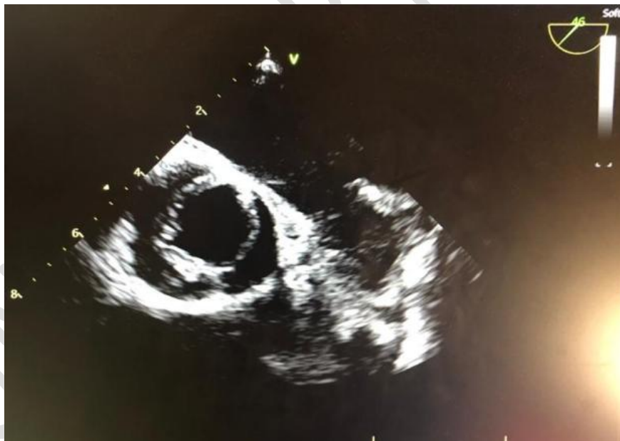
Figure 3 : TEE showing unicuspid and unicommissural aortic valve