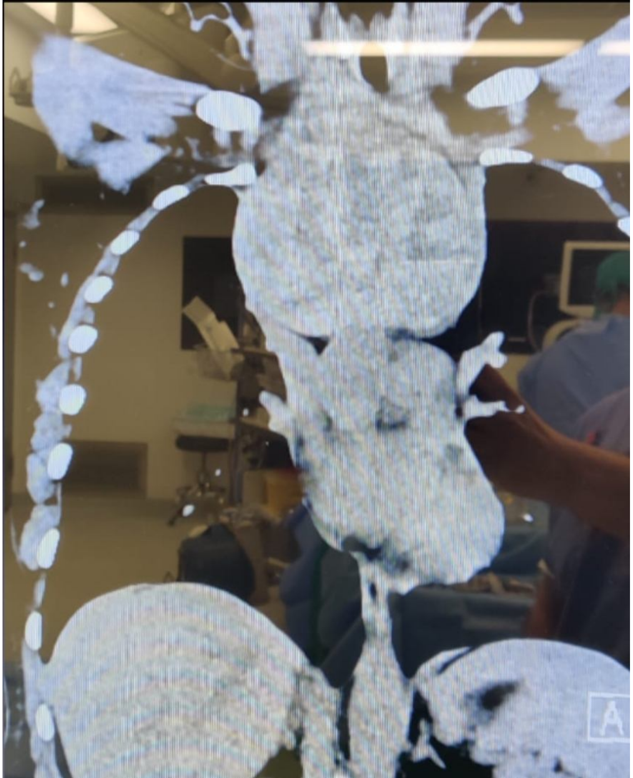
Figure 1: Rescue venoarterial extracorporeal membrane