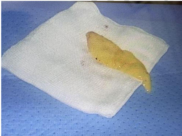
Fig 4: Outside the abdomen