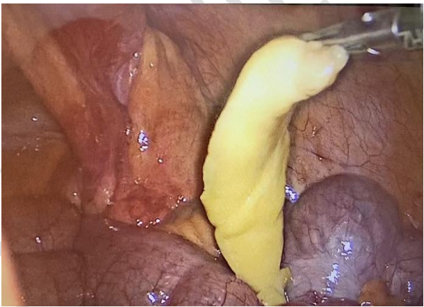
Fig 3: During extraction