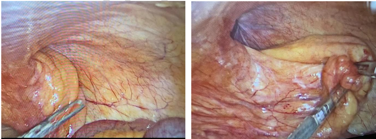
Fig 1: Before seeing the lipoma

A 43-year-old male patient who is previously healthy, presented at the outpatient clinic by a picture of an uncomplicated right side inguinal hernia. He was scheduled for laparoscopic hernia repair (TAPP repair). On laparoscopy, a free mass like lipoma was found inside the hernia sac, which was extracted easily by forceps and sent for histopathology. The gross picture of histopathological examination revealed a yellow adipose tissue fragment measuring 6.6 x 2.3 x .7 cm and microscopically showed mature fat cells with fat necrosis. The patient had a postoperative smooth course, and he was discharged home on the 1 st postoperative day. On follow-up, after 15 days the patient was completely asymptomatic.