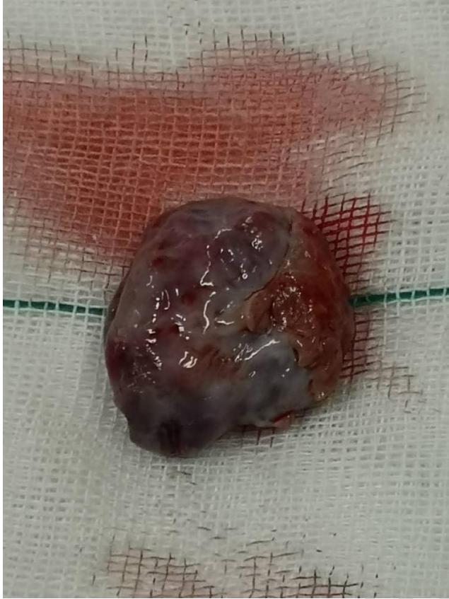
figure 2: mass view after resection