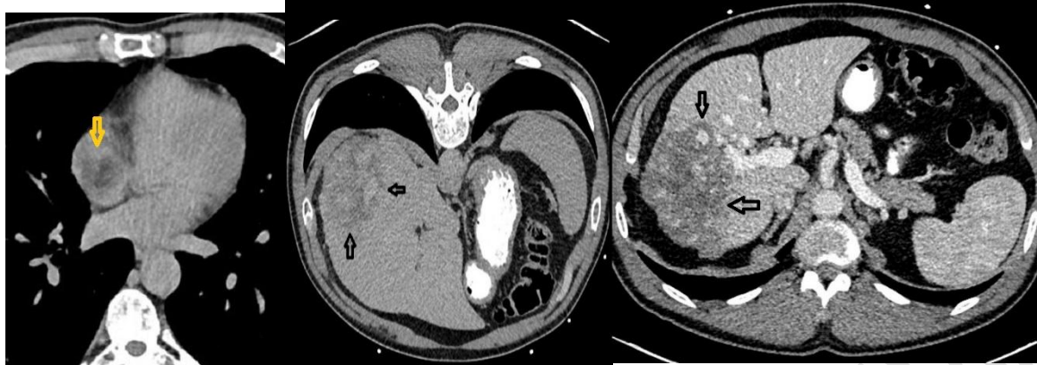
Figure 3 : Prospective ECG gated

Cardiac CT Angiography(a,b) reveals a round mass lesion in the right atrium with central lipid core (white arrow) and peripheral soft tissue.