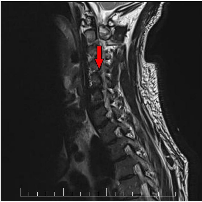
Figure. 1. Prioperative T2-weighted MRI demonstrating severe cord compression by an extradural hypointense lesion originating from posterior arch of c1 (arrow).