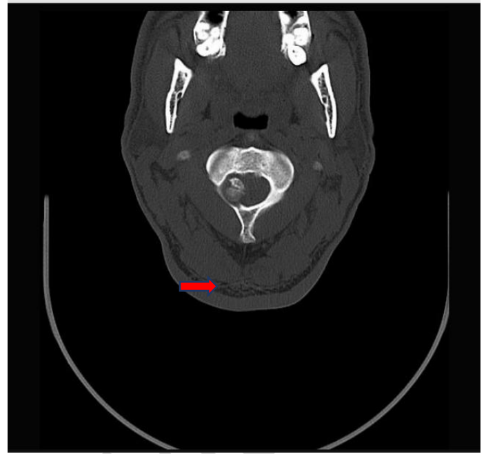
Figure. 2. Prioperative axial CT Scan depicting the relatively hyperdense lesion originating from c1 posterior arch with intraspinal growth (arrow).

After that, patient was admitted to the neurosurgery Ward, and a scheduled surgery was performed the next day. Intraoperative finding was an extradural cervical spine lesion measuring 1.4x1.4x1.2 cm at the level of C1-C2 protruding from the posterior arches of C1 cervical vertebra. So the patient underwent posterior spinal fusion with laminectomy and level C1-C2 Cervical spine extradural lesion resection under general anesthesia with no complications. The resected lesion was sent to pathology department for microscopic examination. The postoperative course was uneventful and the symptoms improved immediately after surgery, and the patient fully recovered without any residual deficit.