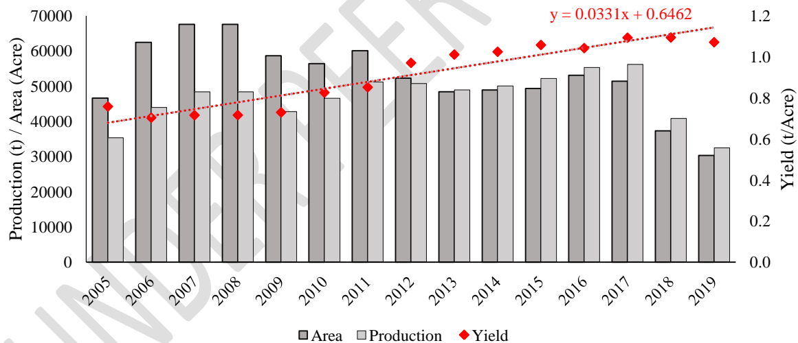
Figure 1: Rice production, area and yield from 2005-2019

Data on rice cultivated area and production in Bhutan showed periodic variability during the last 15 years. Between 2005 and 2019, the total rice area was decreased by about 35%, resulting to 30314 acres from 62458 acres. Similarly, production was decreased by 8%, falling from 35312 to 32466 tonnes. Surprisingly, both the area and the production fell by 41% and 42% respectively between 2017 and 2019. The productivity of milled rice yield, on the other hand, increased from 0.76 to 1.07 tonnes with a 41.3% increase in the same period. Similar findings on the decrease in the area and the rise in production were also reported in other studies [6], [26]. The increase in productivity could be due to the increase in adoption of scientific technologies especially improved variety, as reported by [6], [7], [27]. However, yield remained lower than in Asian major rice-growing countries such as India, Vietnam, Thailand, Myanmar, Indonesia, and particularly Cambodia where rice production increased by 7.45 times between 1984 and 2013 [28].