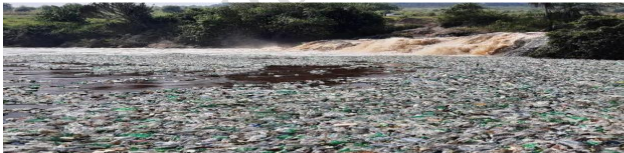
Fig. 5: Waste from the factories emitted in River Rwizi in the western part of Uganda