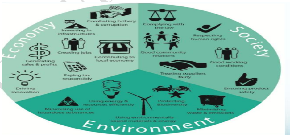
Fig. 3: The linkages between the environment, society and the economy.

The environment, economic and social well-being, coined under the umbrella concept of sustainability are closely intertwined [38]. From the environment, society draws resources that drive economic processes on which society directly or indirectly depends and the environment acts as a sink for emissions and waste [38][39] (see; Fig. 3).