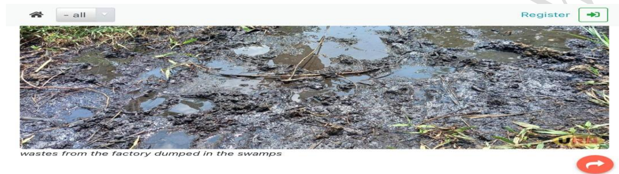
Fig. 4: wastes from the factory dumped in the swamps

However, [38] noted that, environmental pollution in Uganda continue to affect air, water, and land adversely. For example, Air quality monitoring undertaken by [38] revealed that for a number of facilities, emissions of particulate matter (PM2.5 and PM10) is the biggest contributor to air pollution. These emissions resulted from burning of waste and from industrial boilers, furnaces and incinerators [38].