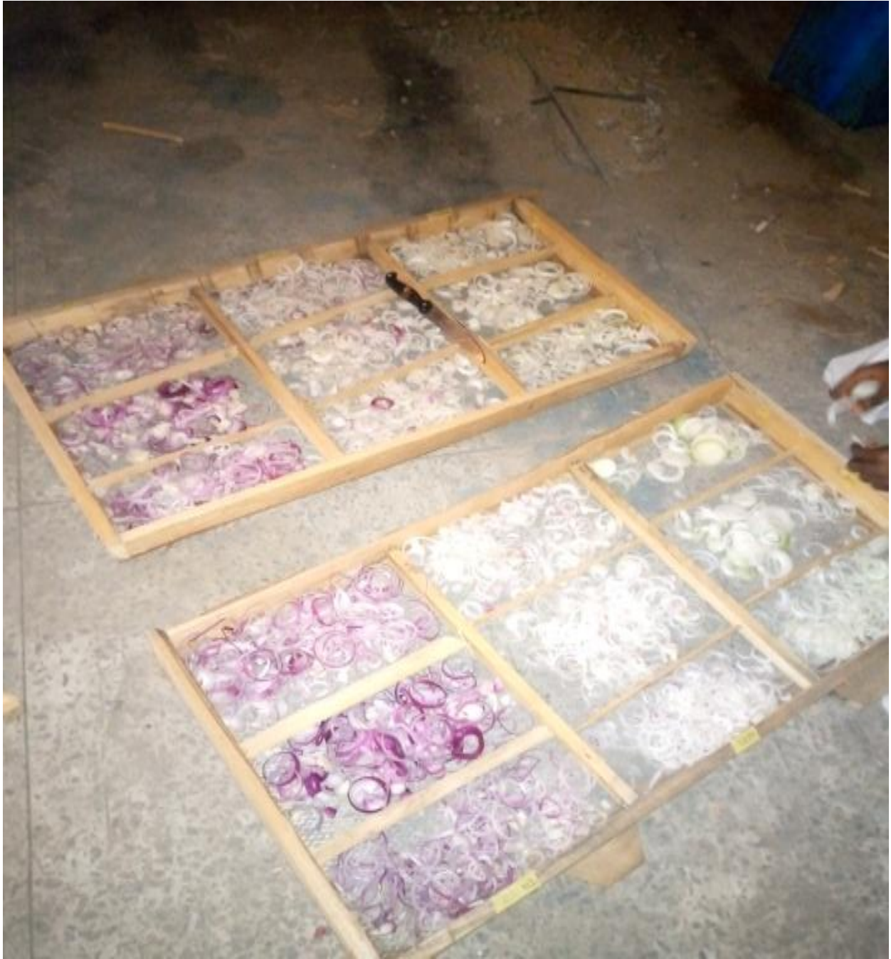
Plate 2: Sliced onion samples on a dryer tray ready for drying.