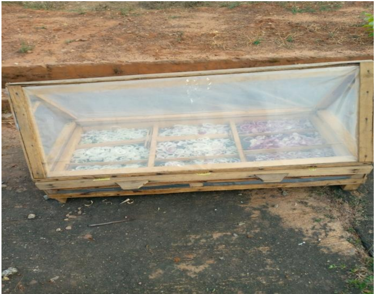
Plate 3: Sliced onion samples in a direct solar dryer.