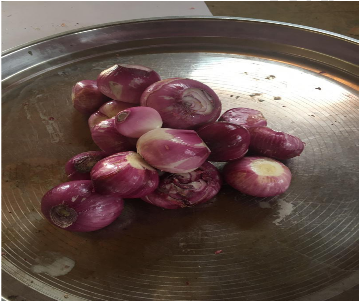
Plate 1: Cleaned onion

Fresh onion samples of 30g from each variety were placed in pre-weighed aluminum weighing dishes and dried in the solar dryer for some hours. The onion was retrieved then weighed. The weighing balance used for the scale had an accuracy of 0.01g. All measurement for each trial were replicated twice and moisture contents were calculated on dry basis using the following formula developed by ADOGA (2005) to obtain the initial moisture contents of red, white and cream onion samples used in this research work.