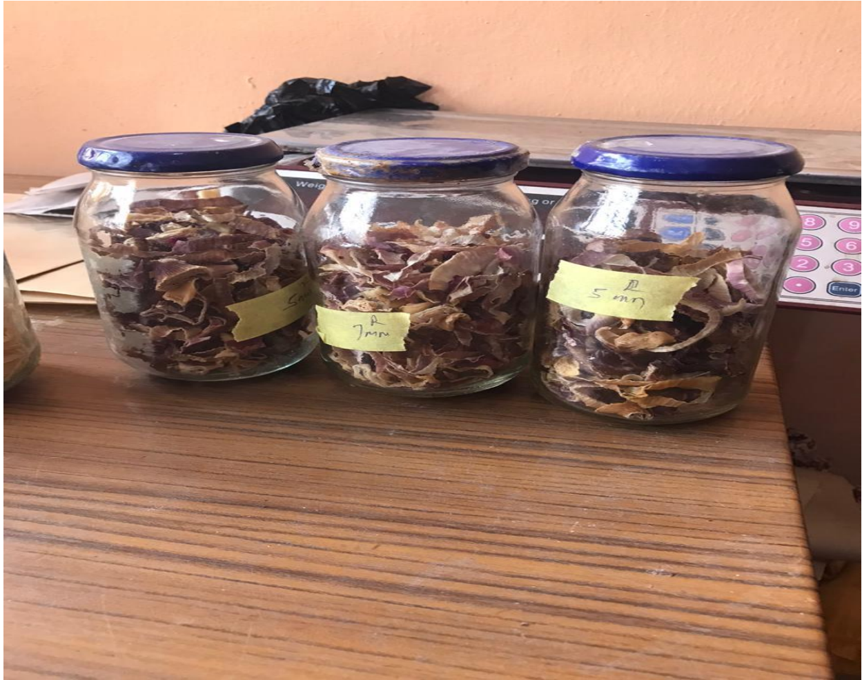
Plate 4: Dried red onions at room temperature