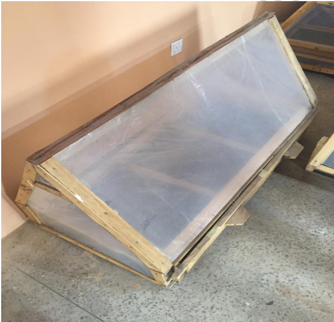
Plate 5: Pictorial view of the multi-crop direct solar dryer