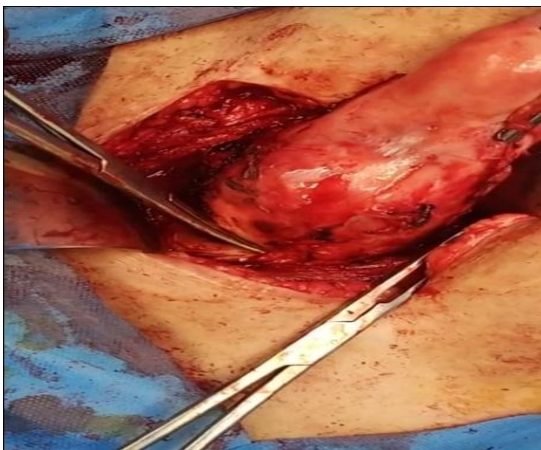
Figure 1 -intra op finding showing ballooned out lower segment

Intra op we found the fundus of uterus normal and the lower segment ballooned out with tumour which was very vascular on appearance with bladder completely adherent to the lower segment .We infiltrated the uterus with dilute vasopressin to achieve hemostasis and hysterectomy was carried out. During dissection of bladder adhesions, we noted a small rent of 2 cm in the bladder (region of invasion to bladder) which was then repaired in 2 layers. The patient was transfused one pint PRBC intra op with estimated blood loss of approximately 700 ml. She recovered well in post op period and was discharged in 3 days in stable condition. Catheter was removed on day 14.