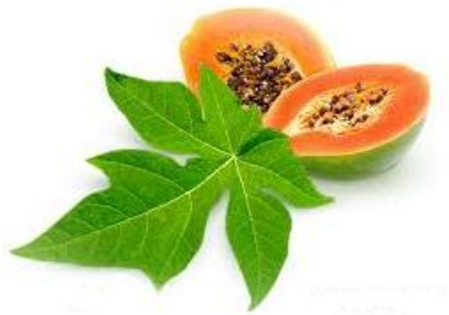
pawpaw ( Carica papaya ).