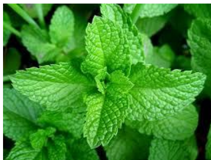
Scent leaf ( Ocimum gratissimum )

These samples were obtained at random from three different sample locations in Amassoma community. The pawpaw fruit and leaf was plucked from Pawpaw tree with a stick and scent leaf was cut with a knife. The used plants were selected because of their frequent use for nutrition and medicinal purpose by the people in the sample area. The most commonly used parts of each plant were considered as experimental target. All plant samples were washed clean using