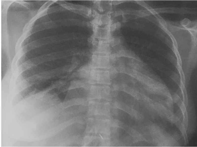
Figure 2 : Chest X-Ray showing cardiomegaly