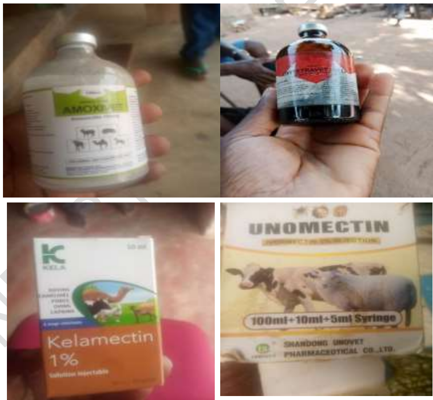
Fig. 2. Antimicrobial use by rabbit's farmers