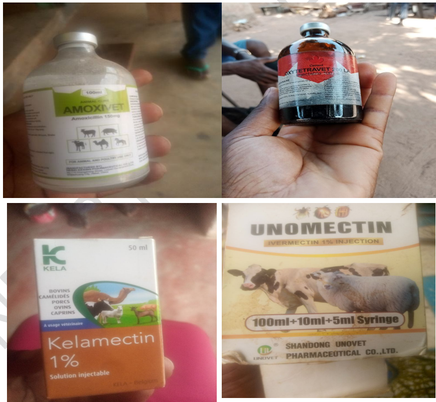
Fig. 2. Antimicrobial use by rabbit's farmers