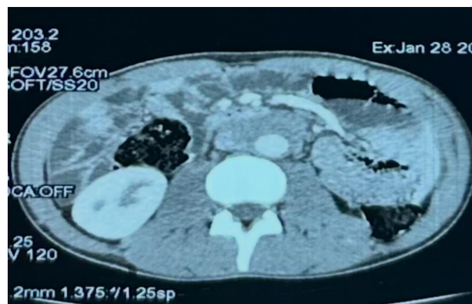
Figure 1 : A abdominal CT scan shows a tissue sheath enveloping the aorta.

A thoraco-abdomino-pelvic CT scan with angiographic sequence showed a tissue sheath encasing the aorta and inferior vena cava (IVC), hypodense and enhancing homogeneously after contrast injection, measuring 5 cm in transverse diameter and 6.6 cm in height, extending 1.5 cm below the origin of the renal arteries to the aortic bifurcation, suggestive of retroperitoneal fibrosis (figure 1). The scan also showed pre-aortic and mesenteric lymphadenopathies, the largest measuring 11 mm, a very thin but patent left renal artery with a nephritic kidney (Figure 2), superior polar splenic lesion, and pulmonary micronodules.