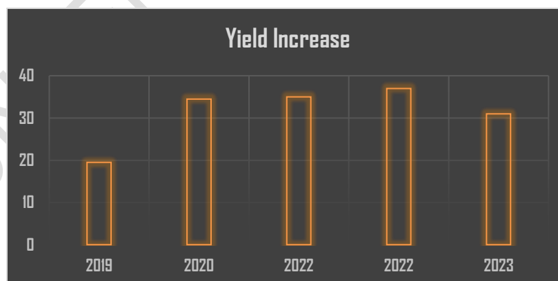
Figure 2. Impact of Introduction of hybrid castor as an alternate crop on Yield increase (per cent)