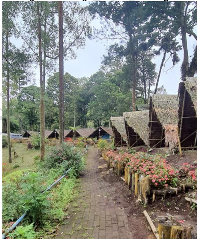
Figure 5. Resting Huts at Puncak Tangke Tabu