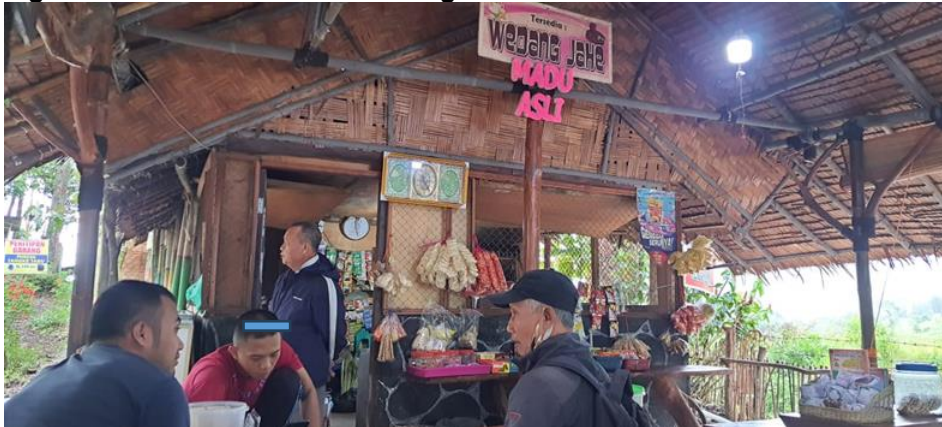
Figure 4. Food Stall at Puncak Tangke Tabu

Current amenities include food stalls, prayer facilities, and clean toilets. Opportunities for development include the addition of souvenir shops, healthcare clinics, and accommodation options tailored to elderly visitors.