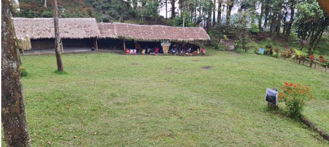
Figure 7. Clean Environment at Puncak Tangke Tabu

Visitors currently benefit from a clean and tranquil environment. Additional efforts to upgrade infrastructure, such as repairing food stall roofs and improving children's play areas, will enhance the overall comfort of tourists.