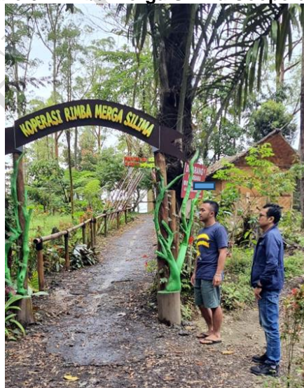
Figure 6. Rimba Merga Silima Cooperative Team

Management by the Rimba Merga Silima Cooperative has contributed to the organized development of Puncak Tangke Tabu. Expanding the cooperative's reach through content creators and digital marketing strategies could significantly boost its promotional efforts.