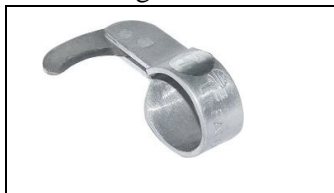
Pic 1-Ring cutter

The present study employed an exploratory research design to assess the drudgery faced by farm women in brinjal harvesting and to assess the impact of an improved ergonomic tool. This design was chosen to examine existing practices causing drudgery. The study was conducted in Kaveliguda village, located in Shamshabad Mandal of Rangareddy District. This area was selected due to its extensive cultivation of brinjal over large acres, making it an ideal site for studying harvesting practices and challenges. A total of 30 farm women were selected as respondents for the study, representing those actively engaged in brinjal harvesting activities. Data collection focused on multiple parameters, including grip strength, pinch strength, work output, time required for harvesting, postures adopted and occupational health hazards encountered during the activity. Both traditional harvesting methods and the use of an improved ergonomic tool—the ring cutter—were evaluated.