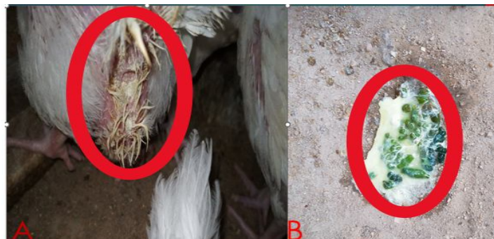
Fig. 1. Soiled vent (A) and greenish feces on the floor (B) in a broiler chicken

Pulled trachea, cloacal swab and blood samples were collected from affected chickens. Virus transport media (VTM) was used to stock the sample for about 12 hours before processing. The samples were divided into two, one part was transported to the Veterinary Microbiology Laboratory for bacteriological investigation while the remaining parts were transported to Virology Laboratory, University of Maiduguri for serological test. Bacteriological tests that were conducted included Gram's staining, culture, biochemical identification and antimicrobial susceptibility testing (AST). Disc diffusion method was used for the AST. Virology tests conducted include hemagglutination incubation (HI) and Hemagglutination (HA) tests (Fig. 4).