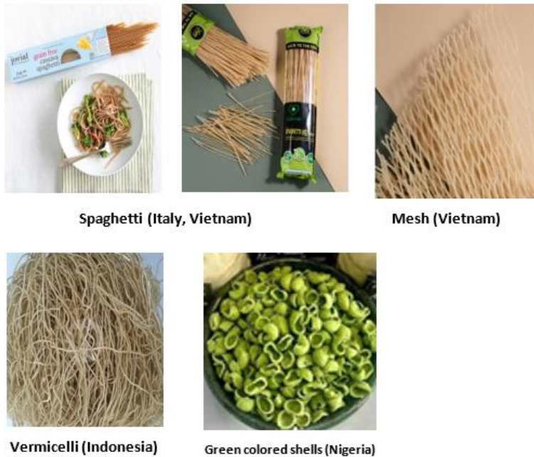
Spaghetti (Italy, Vietnam)