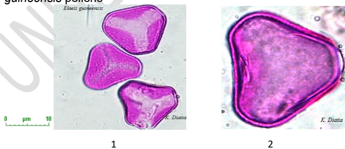
Fig.2. Elaeis guineensis (1: 50X ; 2 : 100X )

Commented [E216]: The technical description of the pollen is detailed, but it would be useful to clarify certain terms that may not be immediately clear, e.g. "monosulcate," "colpus," "tectum," "endexine," and so on.