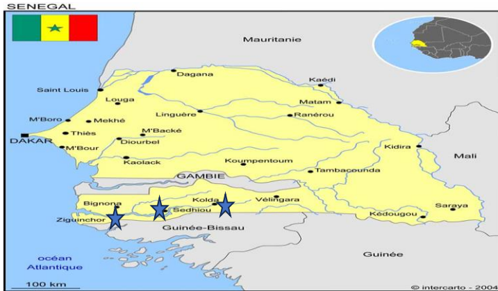
Fig.1. Map of Casamance in Senegal