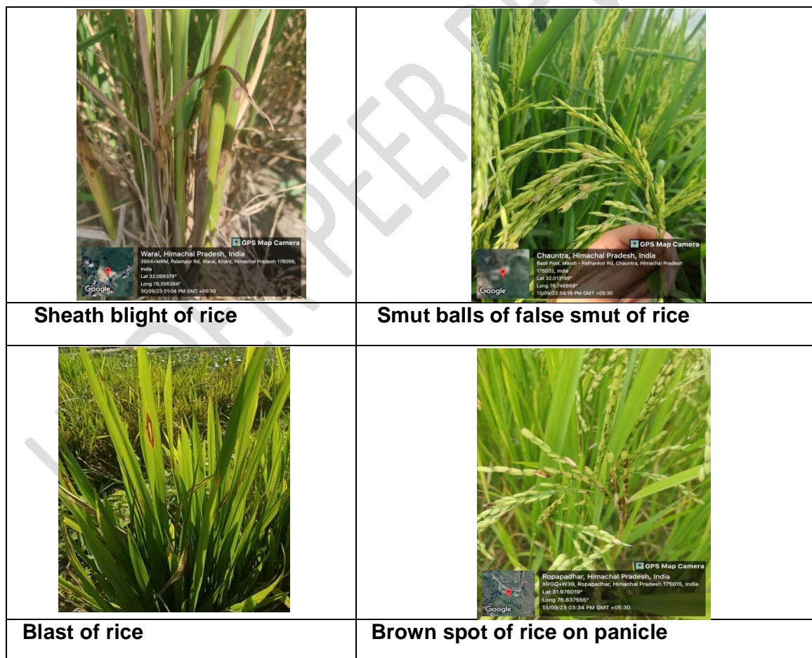
Figure 1: Diagnostic symptoms observed during surveys of different rice diseases during kharif 2022 and 2023