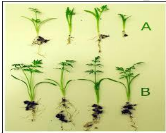
Fig. 3:- Caraway seedlings (25 days old) (A) from non-primed seeds and (B) from primed seeds with 5% PEG for 24 h. (Mirmazloumet et al. , 2020)

Osmotic priming, also known as osmotic-priming or osmotic-conditioning, involves immersing seeds in an osmotic solution rather than pure water in shallow water. Due to the low water content of the osmotic solution, water gradually enters the seeds, increasing water absorption and promoting seed growth while preventing the production of free radicals. Inorganic salts such as sodium chloride (NaCl), potassium chloride (KCl), potassium nitrate (KNO 3 ), tripotassium phosphate (K 3 PO 4 ), potassium dihydrogen phosphate (KH 2 PO 4 ), and calcium chloride (CaCl 2 ). Due to its unique properties, PEG is the most commonly used drug for osmotic priming. The size of the PEG molecule limits its ability to enter the seed, reducing the direction of damage to the seed and limiting the ability of the seed to penetrate. PEG has other disadvantages such as high viscosity which reduces the rate at which oxygen can diffuse into the solution. Therefore, mechanical aeration is often used during PEG installation (Srivastava et al. , 2022).