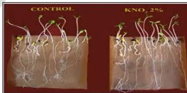
Fig.2: Effect of seed priming in germination and seedling vigour of sunflower hybrid (Manonmani et al. , 2014)

It occurs by soaking seeds in inorganic salt solutions such as sodium chloride (NaCl), potassium nitrate (KNO 3 ), calcium chloride (CaCl 2 ), and calcium sulfate (CaSO 4 ). Use different types of salt to flavor the seeds. The use of germination stimulating solutions promotes the emergence of seeds and seedlings even in adverse environmental conditions. A tolerable NaCl solution is used to treat the seeds. The results of extensive study on halopriming regeneration include notable enhancements in seed germination, seedling emergence, and establishment, as well as the elimination of agricultural yields in salty soils as reprisal for halo-priming. When preparing seeds, sodium chloride (NaCl) and potassium chloride (KCl) were particularly effective in removing the negative effects of salt. (Srivastava et al. , 2022)