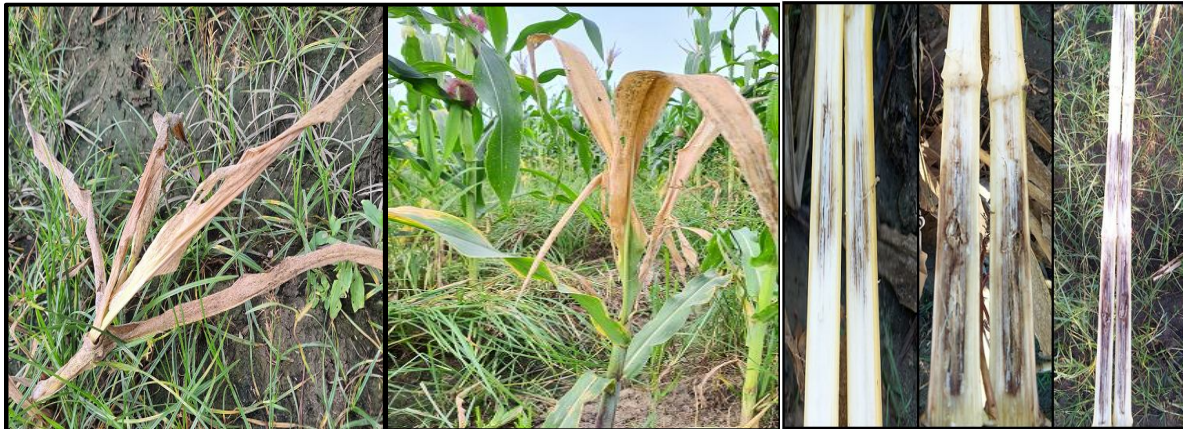
Fig. 2: Drying and killing of maize stalk by D. zea causing bacterial stalk rot

iron between the two organisms could determine the outcome of an invasion (Enard et al. , 1988). The bacterium enters the host through natural opening, abrasions or wounds created by specific feeding insects. The infected stem pith disintegrates and show slimy soft-rot symptoms with foul-smell and eventually the whole plant wilts (Hseu et al. 2008). Due to severe infection cobs filling are not perfect and plants were killed before physiological maturity. Infection generally exaggerated with high temperature and humidity. A frequent rain produces more prevalent symptoms (Fig. 2).