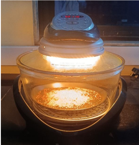
Figure 1: Halogen Air Fryer equipment