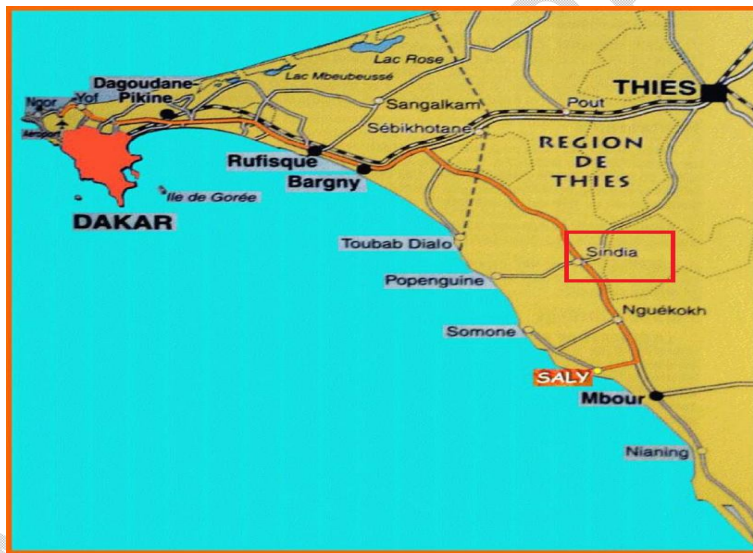
Fig.1. The localisation of study area [On line https://www.villa-saly-senegal.com/visites/geolocalisation ].

The Ngoltongobotanicalgarden covers 25 ha, is located in the rural community (CR) of Sindia, in the department of Mbour in the Thiesregion (Fig.1). It is bordered to the north by the rural community of Diass, to the south by the rural community of Malicounda, to the east by the district of Notto (CR Tassette), Sessène (Sandiara) and Fissel (Ndiagianiao) and to the west by the Atlantic Ocean. The Sindia CR covered an area of 158 km 2 . Today it has 19 official villages with a population of 28,728 [16]. Sindia CR has two types of soil: tropical ferruginous soils (dior, deck, deck dior soils) and hydromorphic soils. Sindia CR has two types of soil: tropical ferruginous soils (dior, deck, deck dior soils) and hydromorphic soils. The garden is located on a laterite plateau on the slope leading down to the marble-rich soil. The current state of the soils is deteriorated by the destruction of plant cover, deforestation and over-exploitation. There is also a demographic push into the cultivated areas, which in turn advance into the wooded and grazing areas. Commercial activity is mainly in the hands of women, especially in the small-scale trade of fruit, vegetable. Fig.1 shows the localisation of study area.