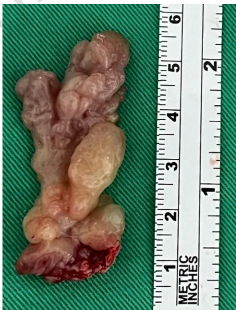
Figure 2: Excised mass from right bulla ethmoidalis