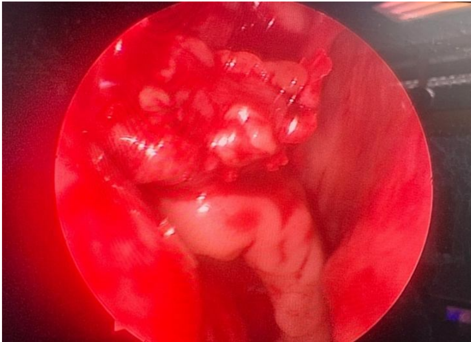
Figure 1: Intraoperative nasal endoscopy shows mulberry liked mass arising from right bulla ethmoidalis