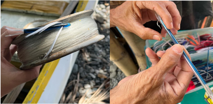
Figure 2. Hook and Line with Artificial Bait

Figure 2 illustrates how fisher folks in Antique use the hook and line method. The hook is inserted in the artificial bait. The artificial bait is attached to a nylon that will be pulled up once the fish is caught.