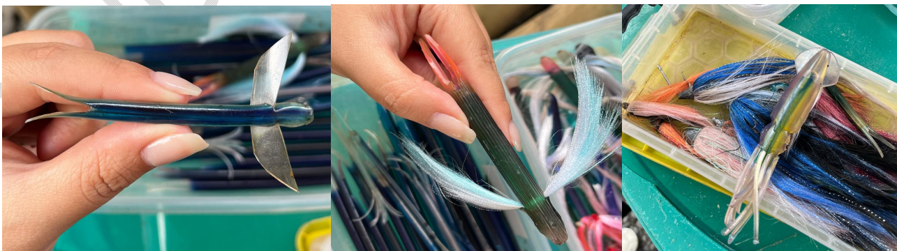
Figure 4. Artificial Baits Used by Antique Fisher Folks

3.2.1.2 Utilization of Different Fishing Methods. Fisher folks observed that certain fishing methods and baits attract different fish species. They use hook and line, bobo, pamana, lambat, pukot, sahid, lambaklad, kubkuban, and likus. All of these fishing methods are legal and regulated. Dammannagoda (2018), even suggested that the hook and line should be propagated around the world as one of the best sustainable fishing method. However, not all of these are considered sustainable by Fisher folks. Gear used in hook and line, pamana, lambat, pukot, kubkuban, and sahid are the same gears used by Fisher folks in the municipalities of Lingayen Gulf and Scarborough Shoal (Gaerlan, et al. , 2018; Arceo, et al. , 2020; Tahiluddin and Terzi, 2021). Whereas, fisher folks in the province of Zamboanga believe that hook and line is the most sustainable fishing method (Schijvenaars, 2017). Likewise, Fisher folks from the province of Batanes hook and line method (Obar, et al. , 2021). As for bobo, this is also considered as sustainable since materials for its gears are biodegradable and non-toxic to fish. Fisher folks from Bantayan Island practice this method but instead of squid or fish they use raw eggs as bait (Lacio, etal. , 2022).