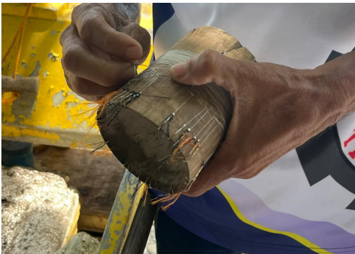
Figure 3. Multiple Hook in a Bamboo Culm

3.1.3.1.1 Hook and Line. This method makes use of bunit or hook and nylon or pole and line. In this fishing method they would use artificial bait to attract fishes. Dyed chicken feathers and old rubber tube shaped like a fish were their artificial baits. But if fishes are not attracted to the artificial bait they would use natural bait such as squid.