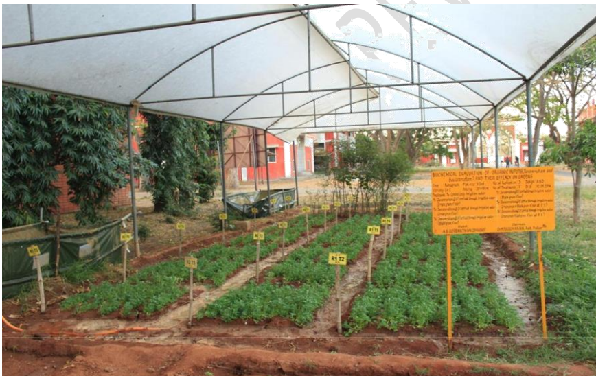
Fig 2. Experimental field view

Sugumaran.M.P, Akila,S and Somasundaram E. (2019). Studies on analysis on biochemical characters of leaf over liquid organic inputs (Panchagavya and Jeevamruth) on Maize ( Zea mays L.). Journal of Pharmacognosy and Phytochemistry. 8(5), 1794-1797.