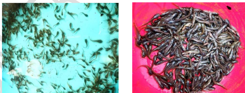
Figure 2: (a) 21-day-old fry; (b) 50-day-old fry

Fry at 21 days and 50 days post-hatching are shown in figures.