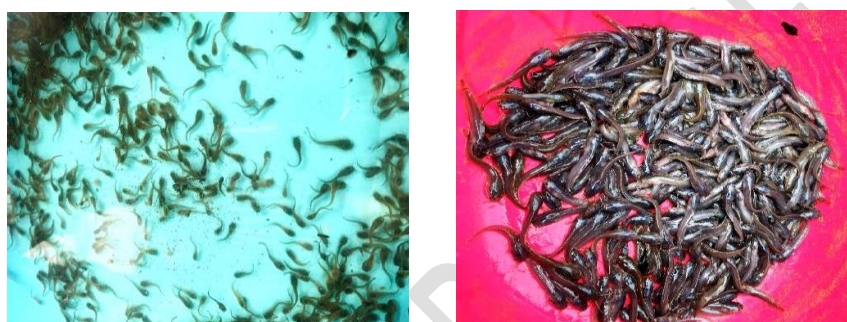
Figure 2: (a) 21-day-old fry; (b) 50-day-old fry ( source, author )