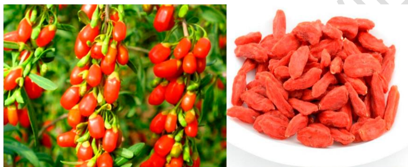
Fig 2. The fresh and dried of Lycium barbarum fruit (22)

Goji berries, originating from China, are called a superfruit due to their high nutrient content and significant biological antioxidant activity (19). Goji berries presented more antioxidant capacity than other fruits such as kiwifruit, raspberry, apple, and orange. This is supported by a study that states the ORAC value of goji berries is 188,52 \mu\text{mol TE/g} of dry weight (higher than other fruits) (20). Goji berries are oval-shaped, reddish-orange in color, and are typically dried for consumption or processed into food, desserts, or mixed into other dishes (can be seen in Figure 2). The components in goji berries that exhibit high biological activity include polysaccharides, carotenoids, and phenolic compounds such as phenolic acids and flavonoids (21).