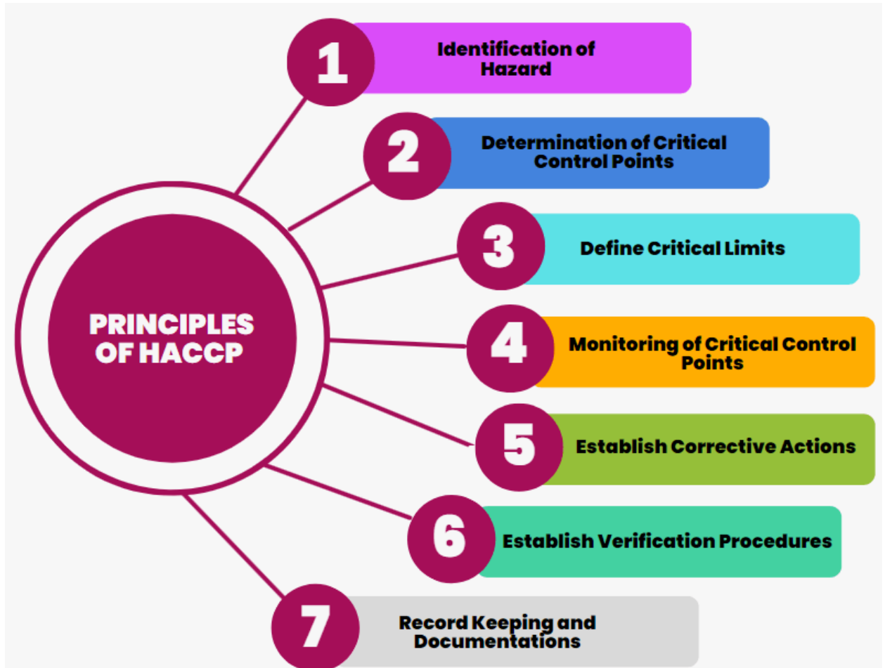
Fig .1 Principles of HACCP