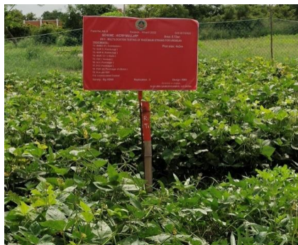
Image .1 Experimental field