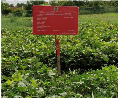
Image .1 Experimental field