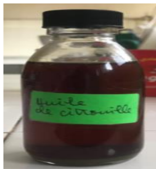
Fig. 3. Oil of Cucurbita pepo by organic extraction

The oil from Cucurbita pepo seeds was greenish yellow in color and liquid in consistency with a characteristic odor (Fig. 3).