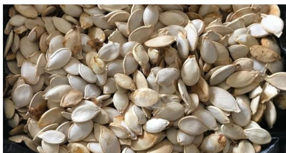
Fig.1. Seeds of Cucurbita pepo

The plant material used in this study consists of seeds of C. pepo L (Fig 1) collected from the Useful Plants Experimentation Garden of the Faculty of Medicine, Pharmacy and Odontology of the Cheikh Anta DIOP University of Dakar. The identification was made at the same laboratory.