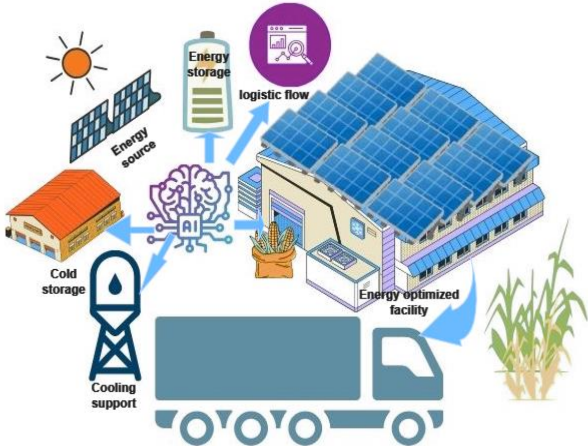
Figure 2. AI-powered solar integration in post-harvest logistics.

Energy Optimization in Solar Dryers and Cold Storage: Solar dryers and cold storage units equipped with AI sensors monitor environmental conditions such as temperature, humidity, and sunlight intensity. AI dynamically adjusts system operations to optimize energy use [40]. For example, during peak sunlight hours, a solar dryer might increase airflow to speed up drying, while at night, stored thermal energy is utilized efficiently under AI control. Incorporating AI into solar-powered systems for post-harvest logistics enhances operational efficiency and minimizes losses. This is illustrated in Figure 2 , which demonstrates the integration of AI-powered solar solutions in post-harvest supply chains.