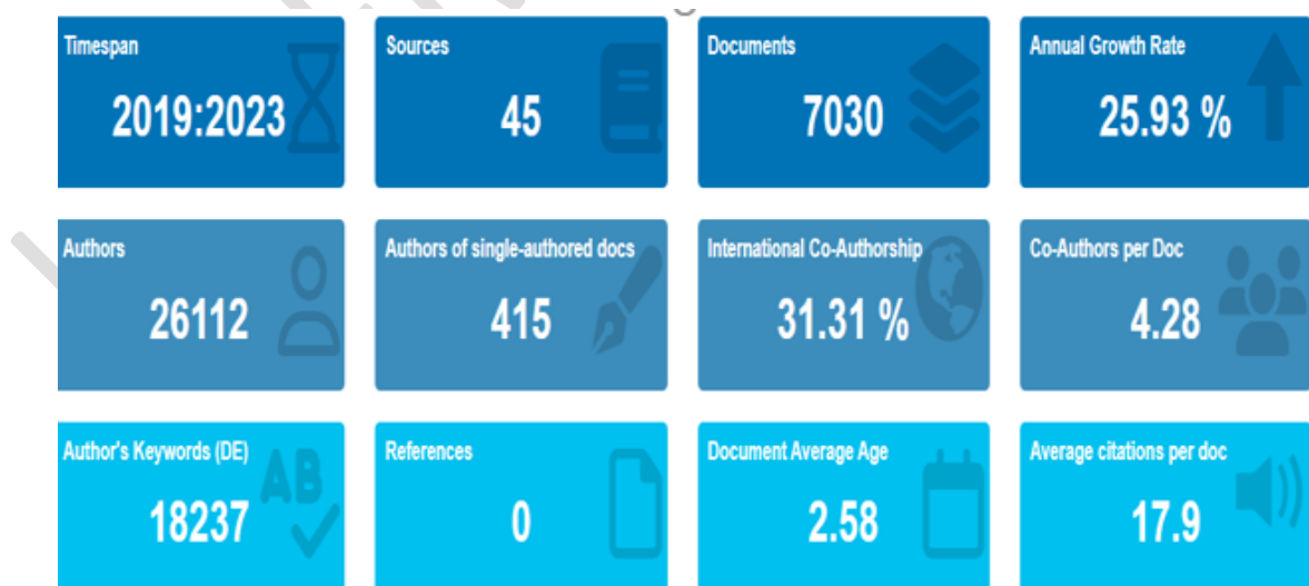
Figure 2: Main Information

Figure 2 shows the dataset from 2019 to 2023 contains 7,030 papers published across 45 sources, with contributions from 26,112 writers and an annual growth rate of 25.93%. The majority of works are collaborative, with an average of 4.28 co-authors per document, while just 415 are single-authored. International collaboration is significant, comprising 31.31% of the works. The authors supplied 18,237 keywords reflecting various study themes. The average age of the documents is 2.58 years, and each receives 17.9 citations, indicating strong impact. Notably, no references were included in the dataset.