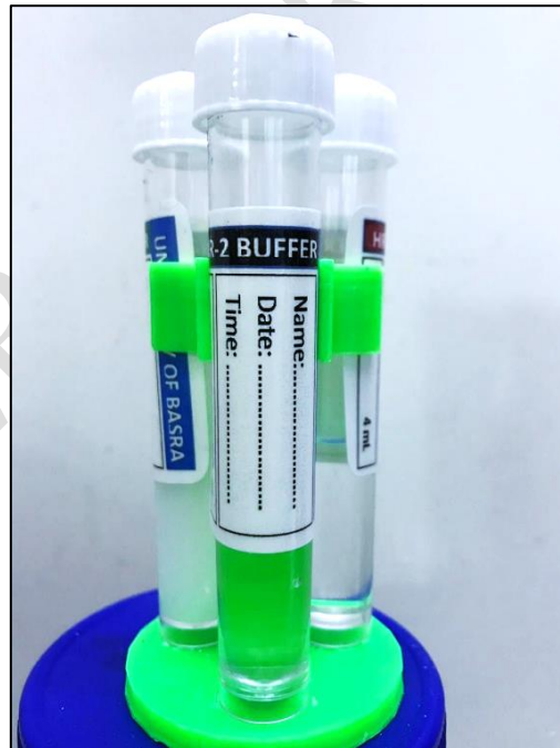
Fig. 1 Kit component, the fourth tube in a holder with the label of each one.

The routine examination of the virus was carried out using the RTPCR technique in the central laboratory of the Basra Health Department, Basra Health Directorate, Basra, Iraq.