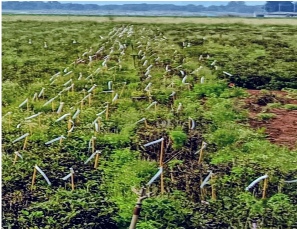
Fig.1. Field view of BC 1 F 4 population