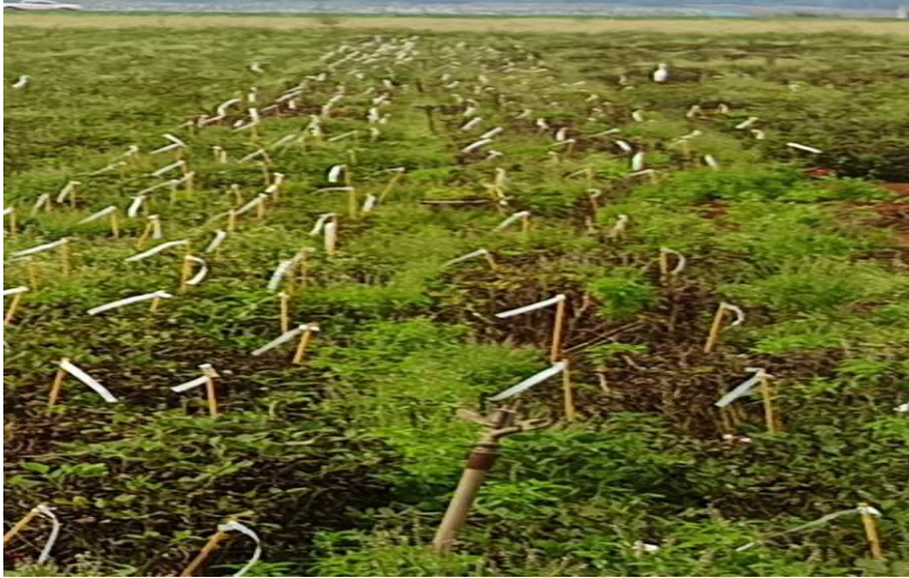
Fig.1. Field view of BC 1 F 4 population

Commented [O4]: This image is very blurr add new image