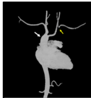
Figure 3: 3D MIP angio view of the heart and thoracic aorta. There is a right sided aortic arch (white arrow). The first part of the left subclavian artery is absent (yellow arrow) with filling of the left subclavian from the left vertebral artery (steal phenomenon).