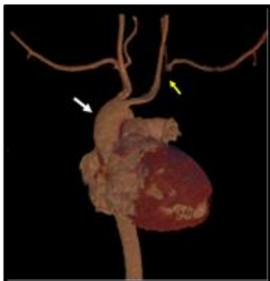
Figure 2: 3D reconstruction of the heart and thoracic aorta. There is a right sided aortic arch (white arrow). The first part of the left subclavian artery is absent (yellow arrow) with filling of the left subclavian from the left vertebral artery (steal phenomenon).

Commented [MO7]: Specify the management detail