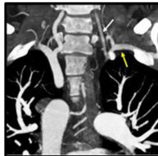
Figure 5: Coronal MIP of the chest mediastinum window. The left subclavian artery (yellow arrow) is taking its supply from the left vertebral artery (white arrow) steal phenomenon.