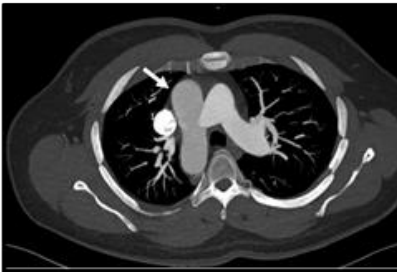
Figure 4: Axial MIP of the chest mediastinum window at the aortic arch level. There is a right sided aortic arch (white arrow).