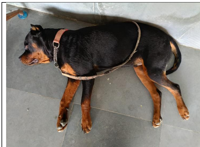
Fig 1: Affected dog presented in lateral recumbency