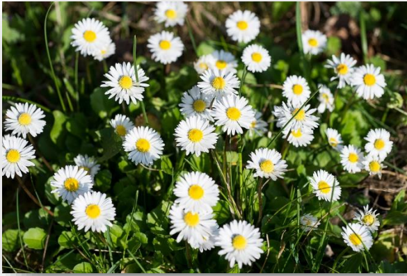
Fig: 2. General view of Matricaria chamomilla