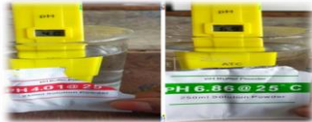
A. pH meter