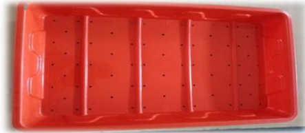
Figure γ: Hydroponic trays