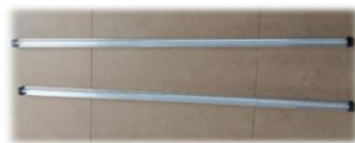
Figure ε: LED spectrum lights