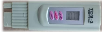
B. TDS Meter