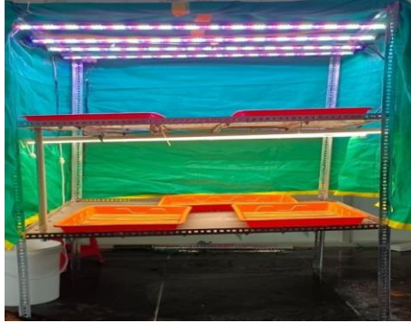
Figure 3: Main frame