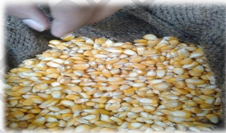
Figure 3: Ganga maize seeds