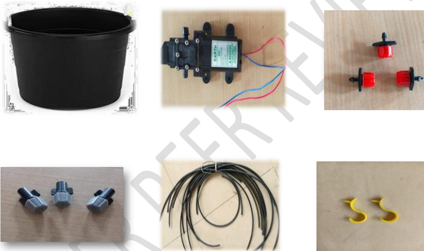
Figure γ: Components of water tank and Irrigation system