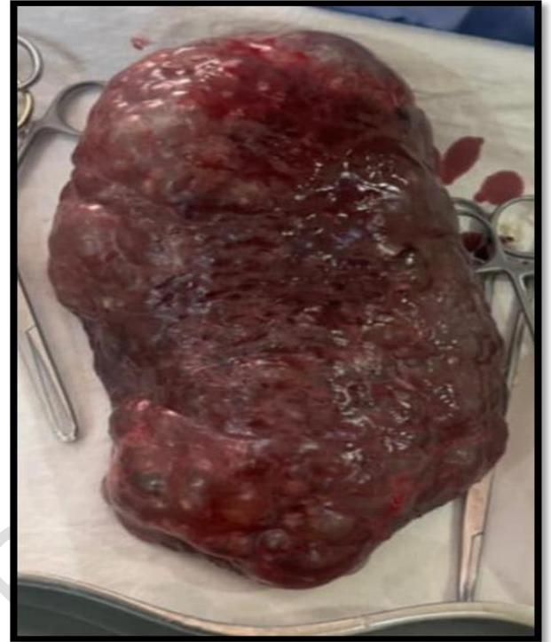
Fig-2 showing per-operative view