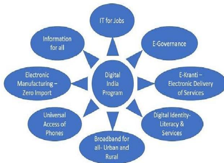
Figure 2: Digital India Initiative

In many rural areas of India, digital infrastructure like good internet connection, digital devices and supply of power is still poor. While initiatives such as Digital India seek to address this disparity, rural women persistently suffer from large gaps in technology-based infrastructure—such as access to computers, smartphones, and solid internet connectivity (Kumar et al., 2017). However, this lack of infrastructure is only compounded by poor quality internet services in remote areas, where unreliable electricity for powering digital devices is a constant barrier barring sustained use of such devices.