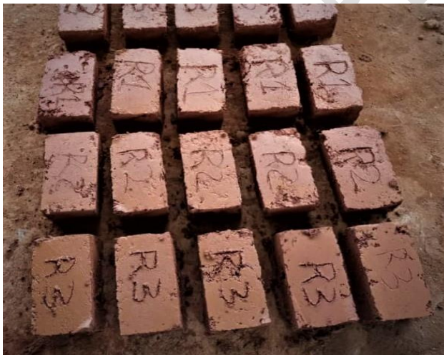
Fig. 1. Photograph showing freshly moulded block specimen